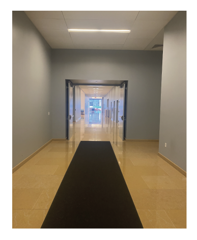
College St. Entrance